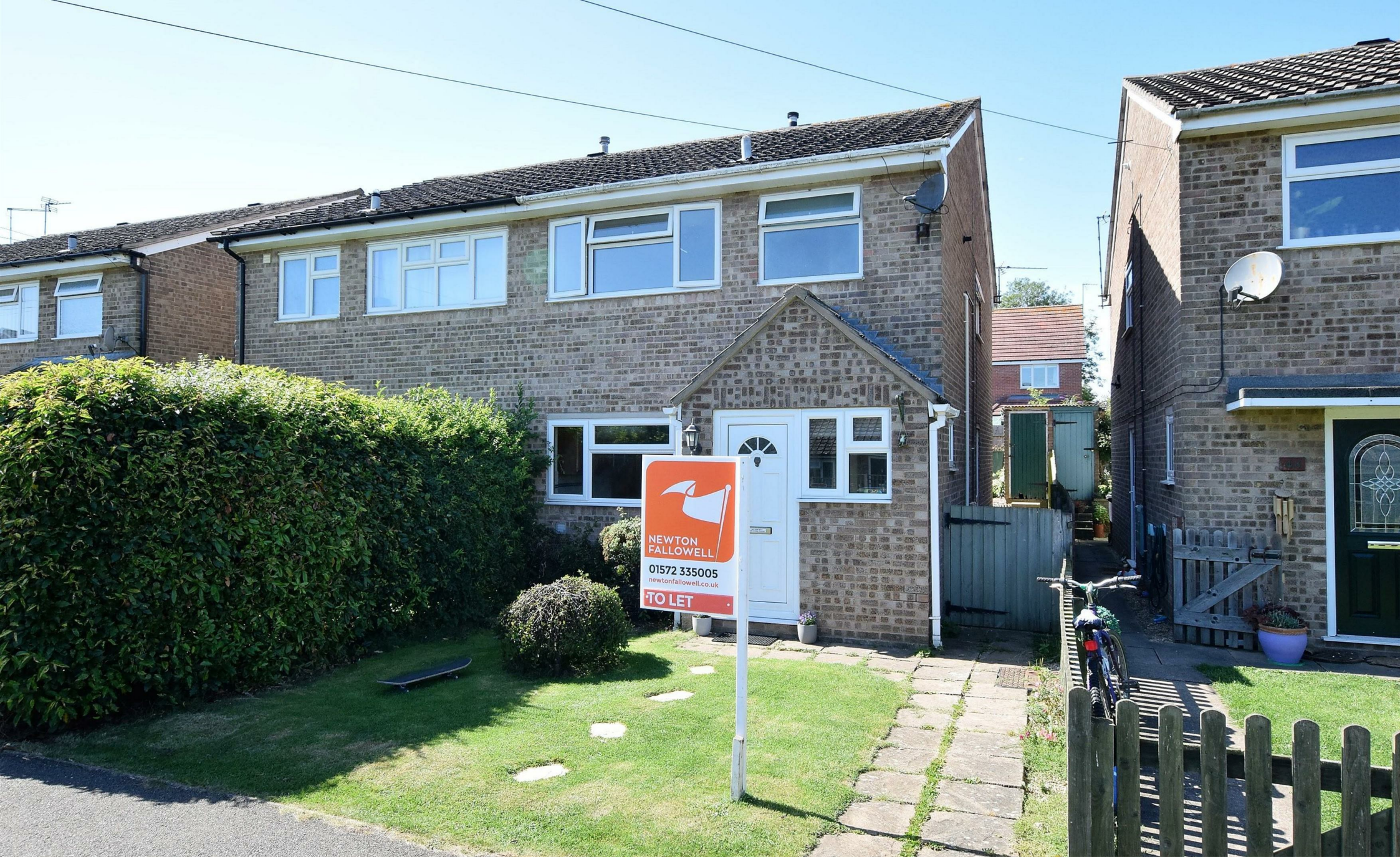
Sherrard Close, Whissendine Oakham, Rutland, LE15 7HE