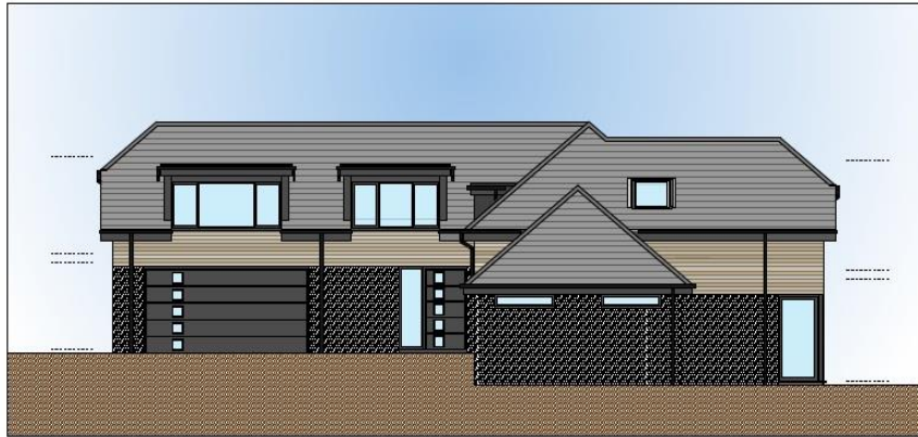
PROPOSED ENTRANCE ELEVATION (Scale 1 to 50 at A1) FACING SOUTH