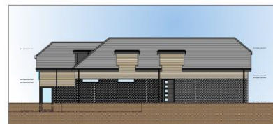
PROPOSED SIDE ELEVATION (Scale 1 to 50 at A1) FACING NORTH