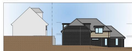
PROPOSED REAR ELEVATION (Scale 1 to 50 at A1) FACING WEST