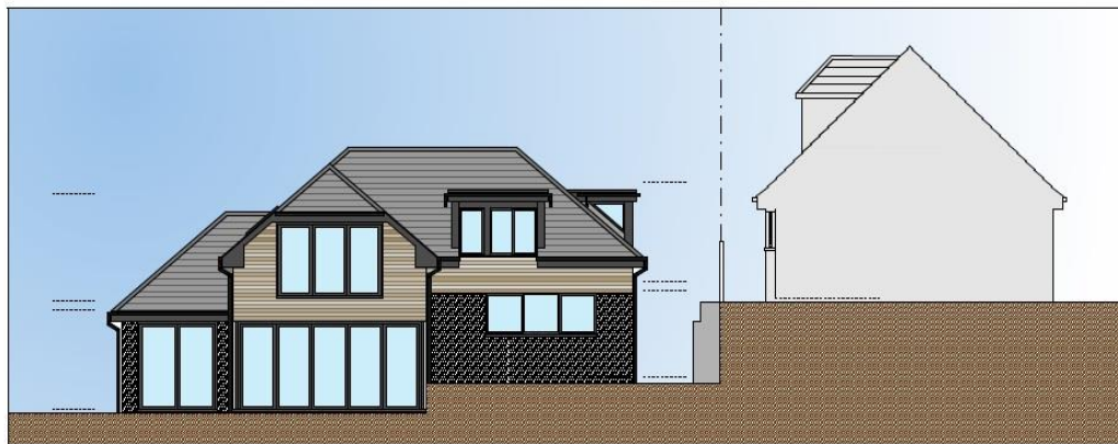
PROPOSED FRONT ELEVATION (Scale 1 to 50 at A1) FACING EAST

PLANNING ISSUE Date: 20/11/2020 By: Rhodri Evans Project: Talbot Green