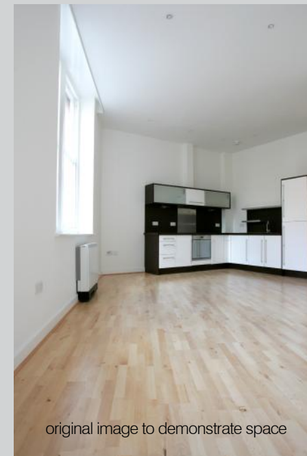
original image to demonstrate space