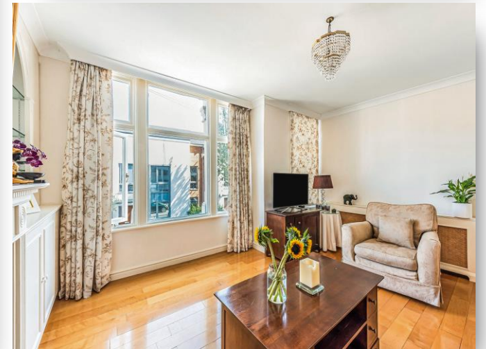
Elbe Street, London SW6 2QP