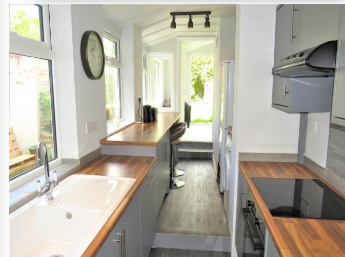
Springfield Road, Linslade, Leighton Buzzard, LU7 2QS