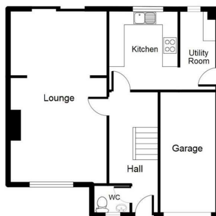
Ground Floor APPROX GROSS INTERNAL FLOOR AREA: 108 sq. m / 1158 sq. ft

PLEASE NOTE : CURRENT COUNCIL TAX BAND IS D.