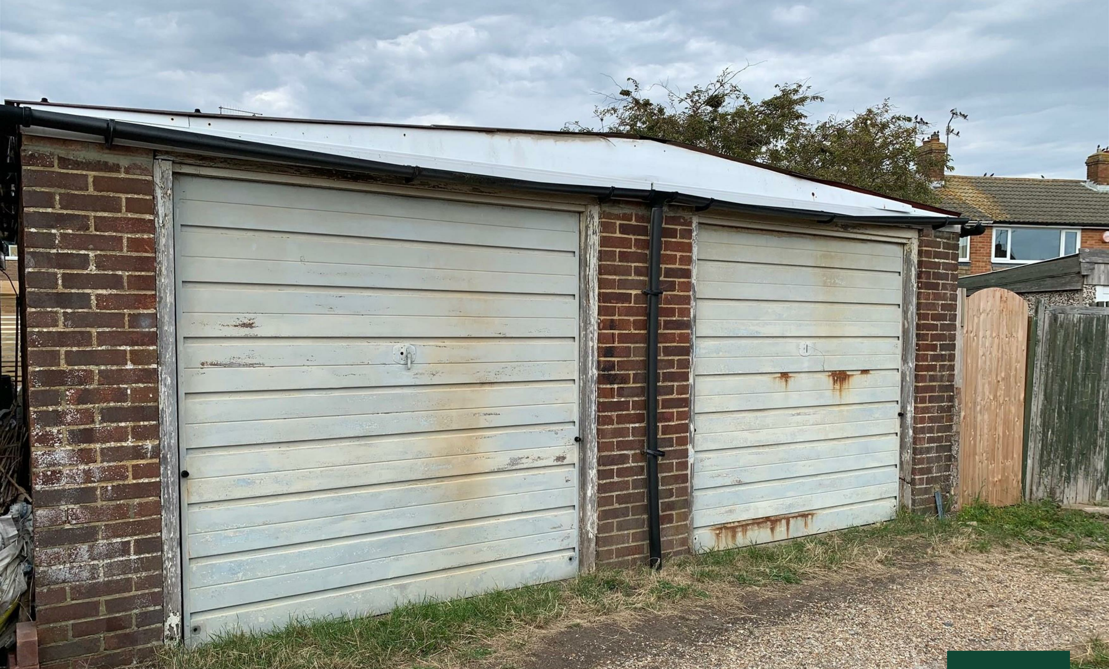
Garages 1 & 2 Kings Close | | Lancing | BN15 8DB