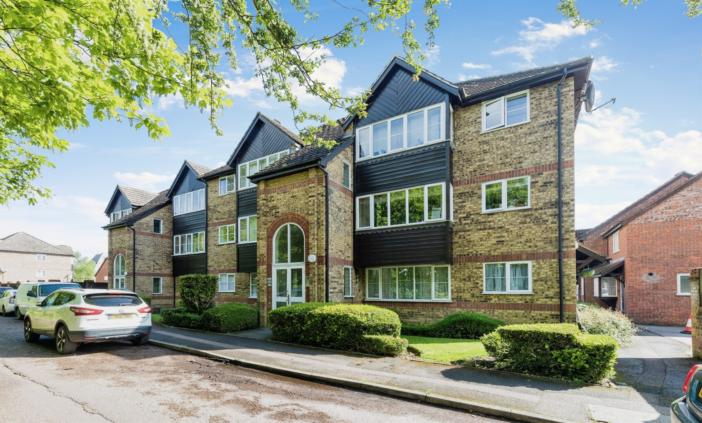
River Meads, Stanstead Abbotts Ware SG12 8EF