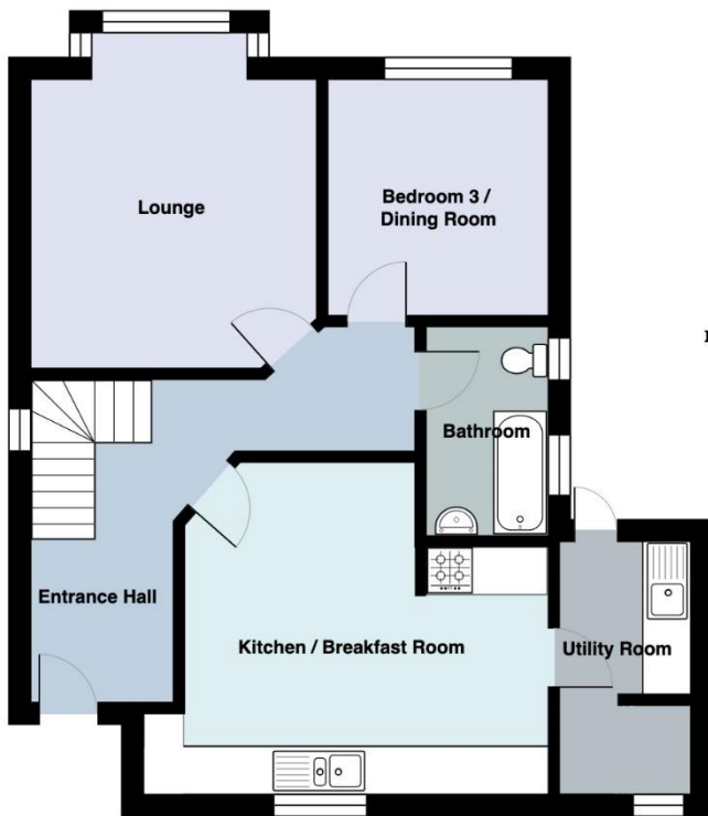
Ground Floor Approx Area: 66.4 m 2 ... 715 ft 2