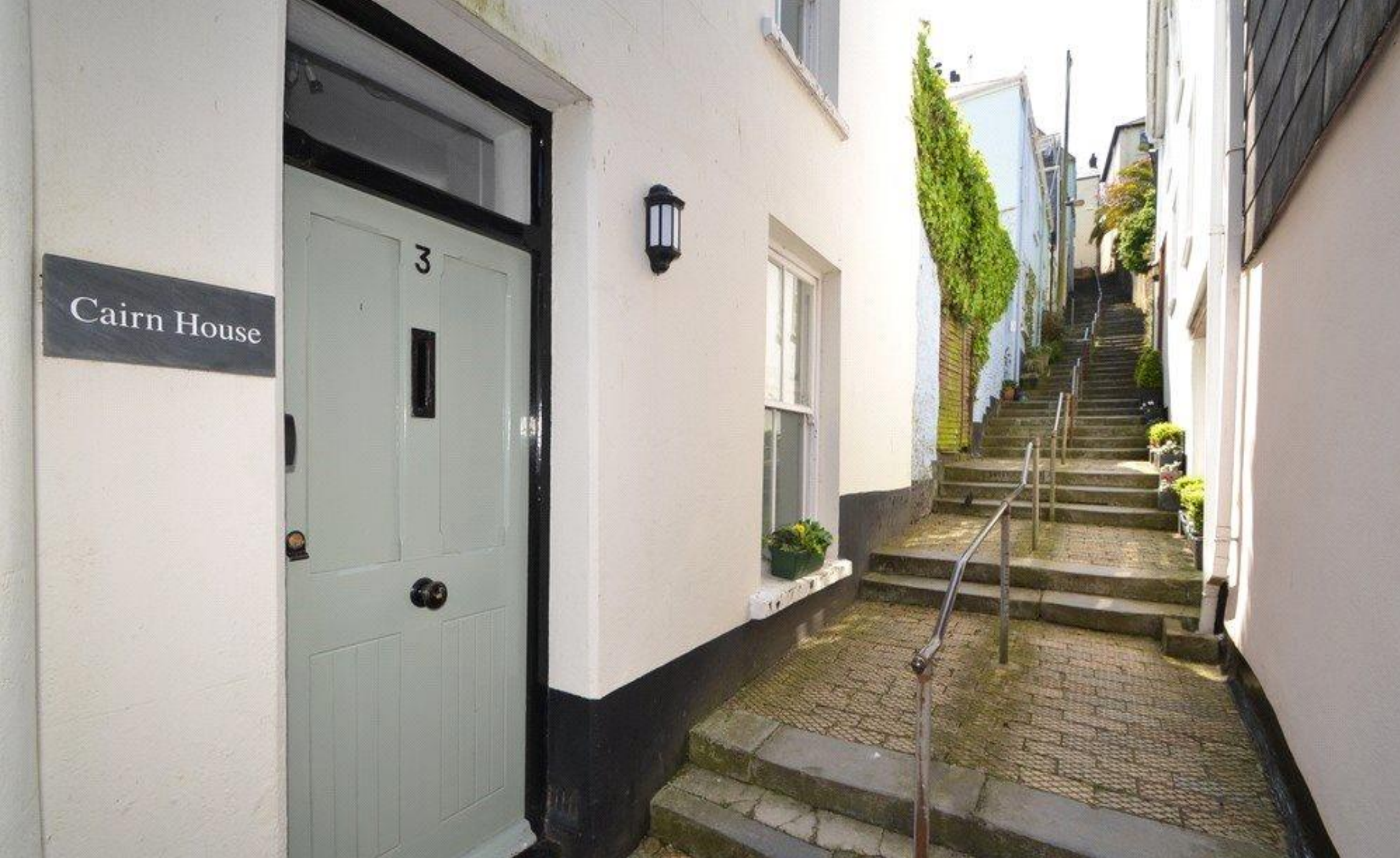
Cairn House, 3 Horn Hill, Dartmouth, TQ6 9RA