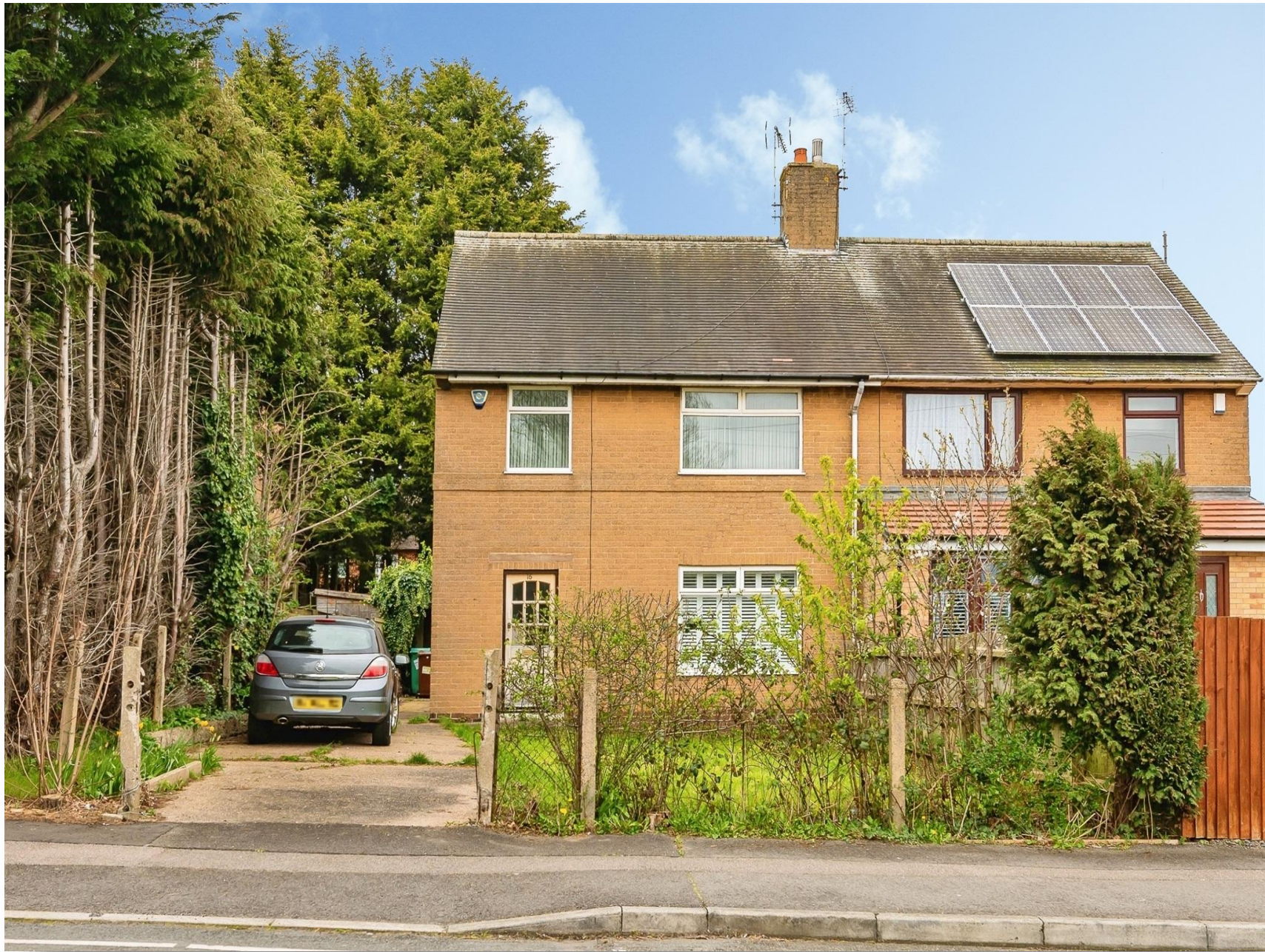
Hanslope Crescent, Nottingham NG8 4BE