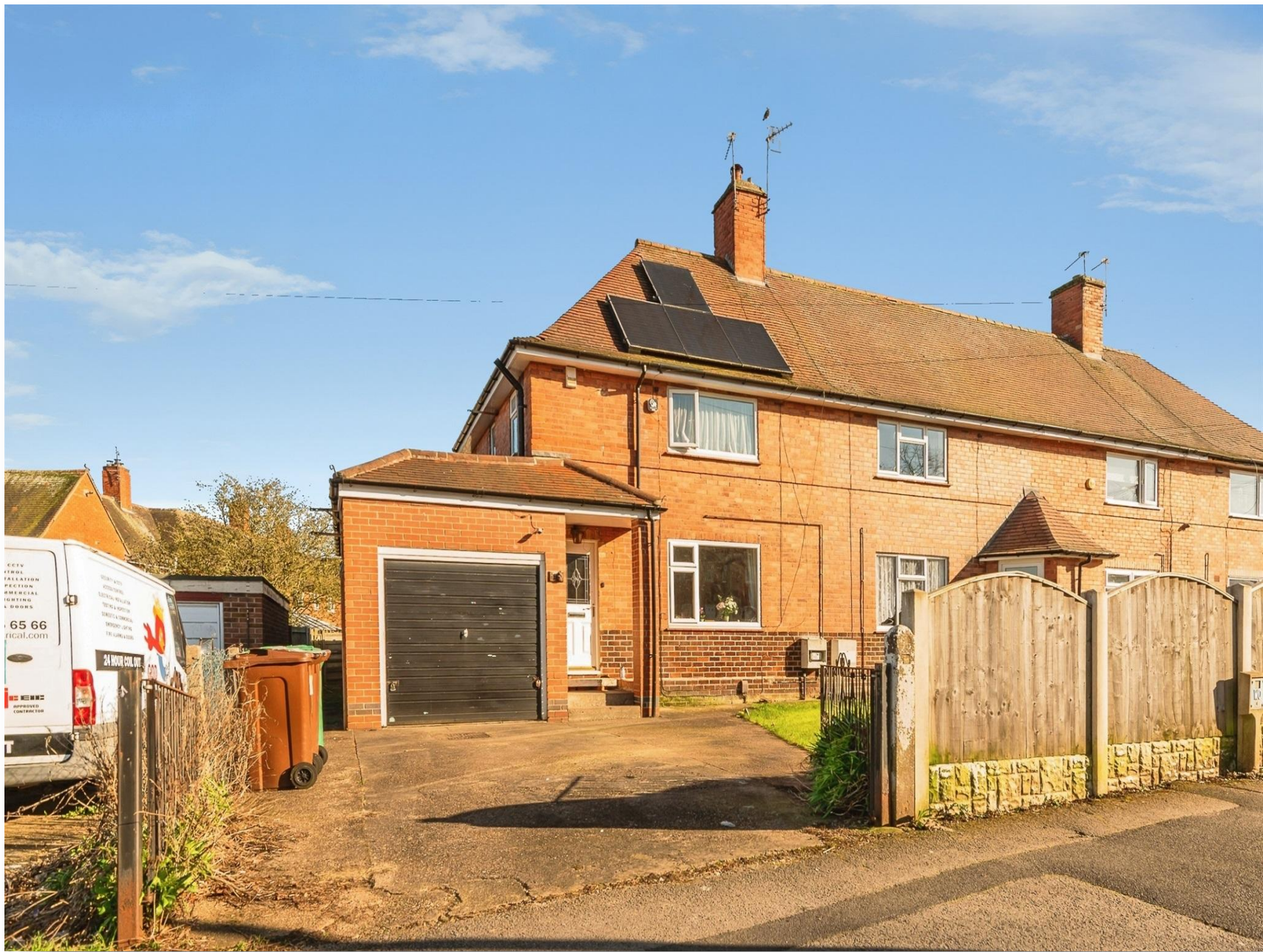
Bells Lane, Nottingham NG8 6EX