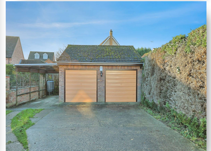
Sherwood, Old Becclesgate, Dereham, NR19 2BD