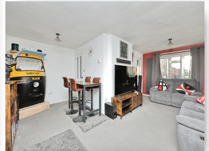
Beech Avenue, Upper Marham, PE33 9NE