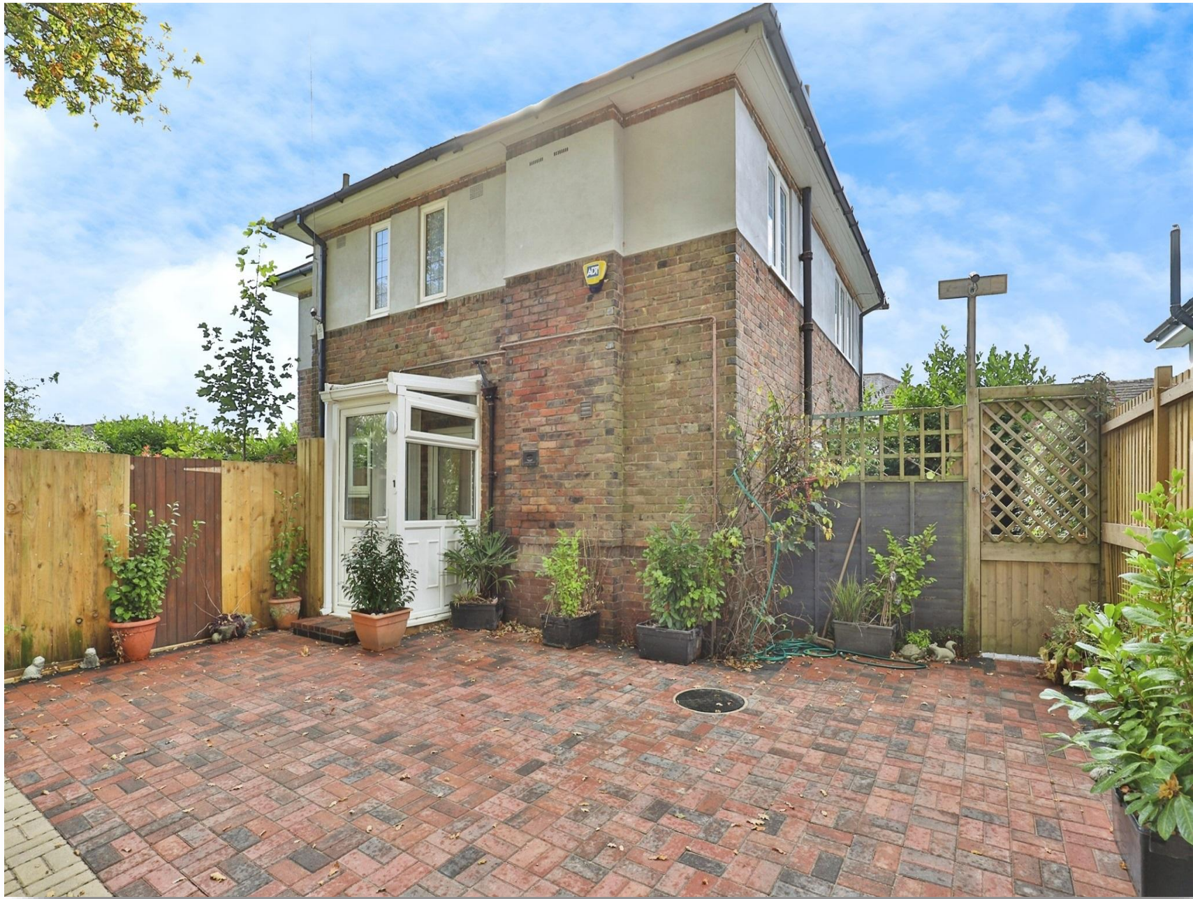
Bridge House Bridge Place, Bournemouth BH10 7EA