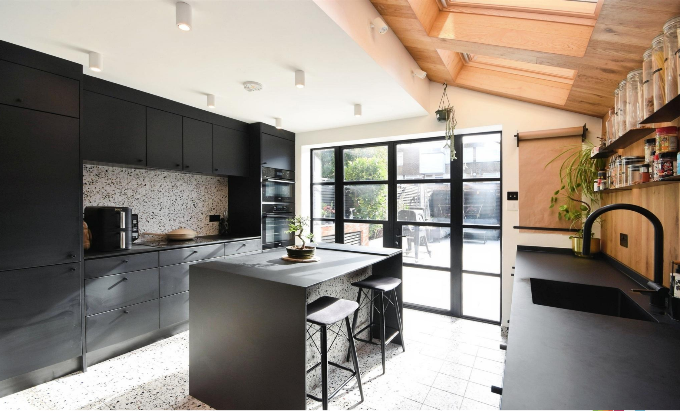
Chase Road, Brentwood, CM14 4LG