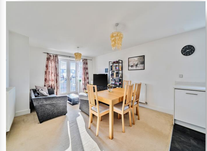
Apartment 7 Ellington House, 5 Foxglove Drive, Maidenhead SL6 2JZ