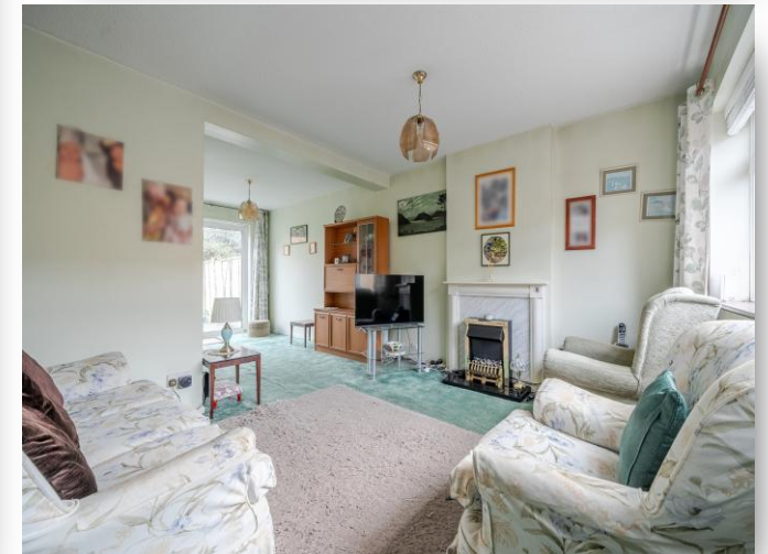
6 Beaumont Close, Maidenhead SL6 3XN