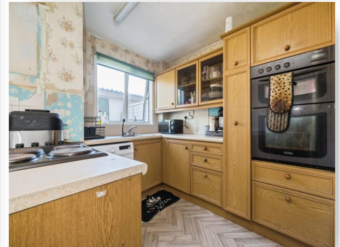
Moore Crescent, Netley Abbey, Southampton SO31 5BY