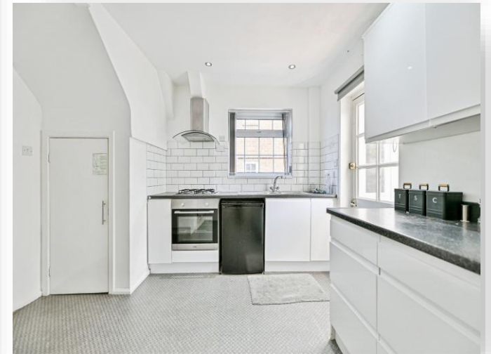
Spinney Close, West Bridgford Nottingham NG2 6HH