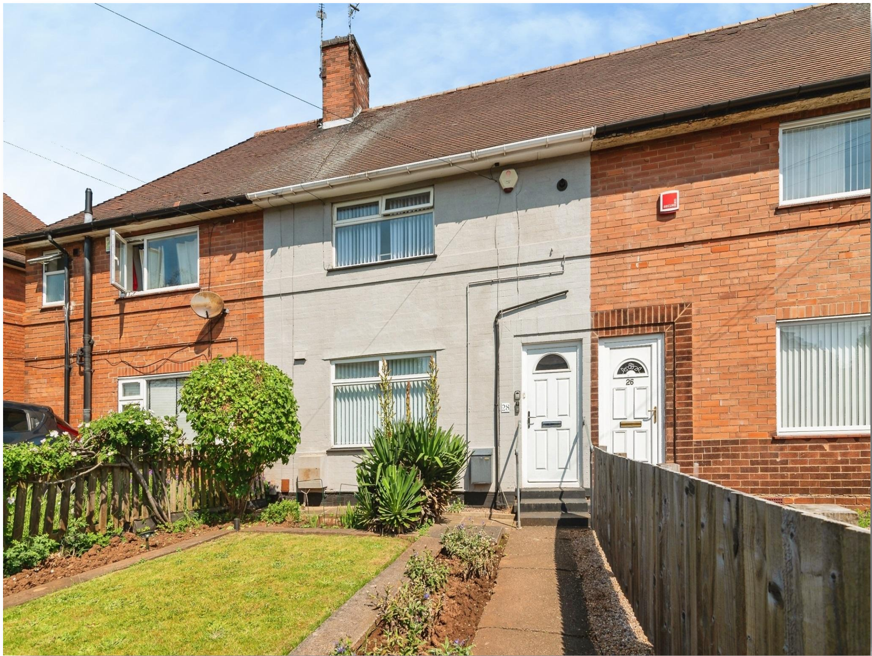
Coleby Road, Nottingham NG8 6FR