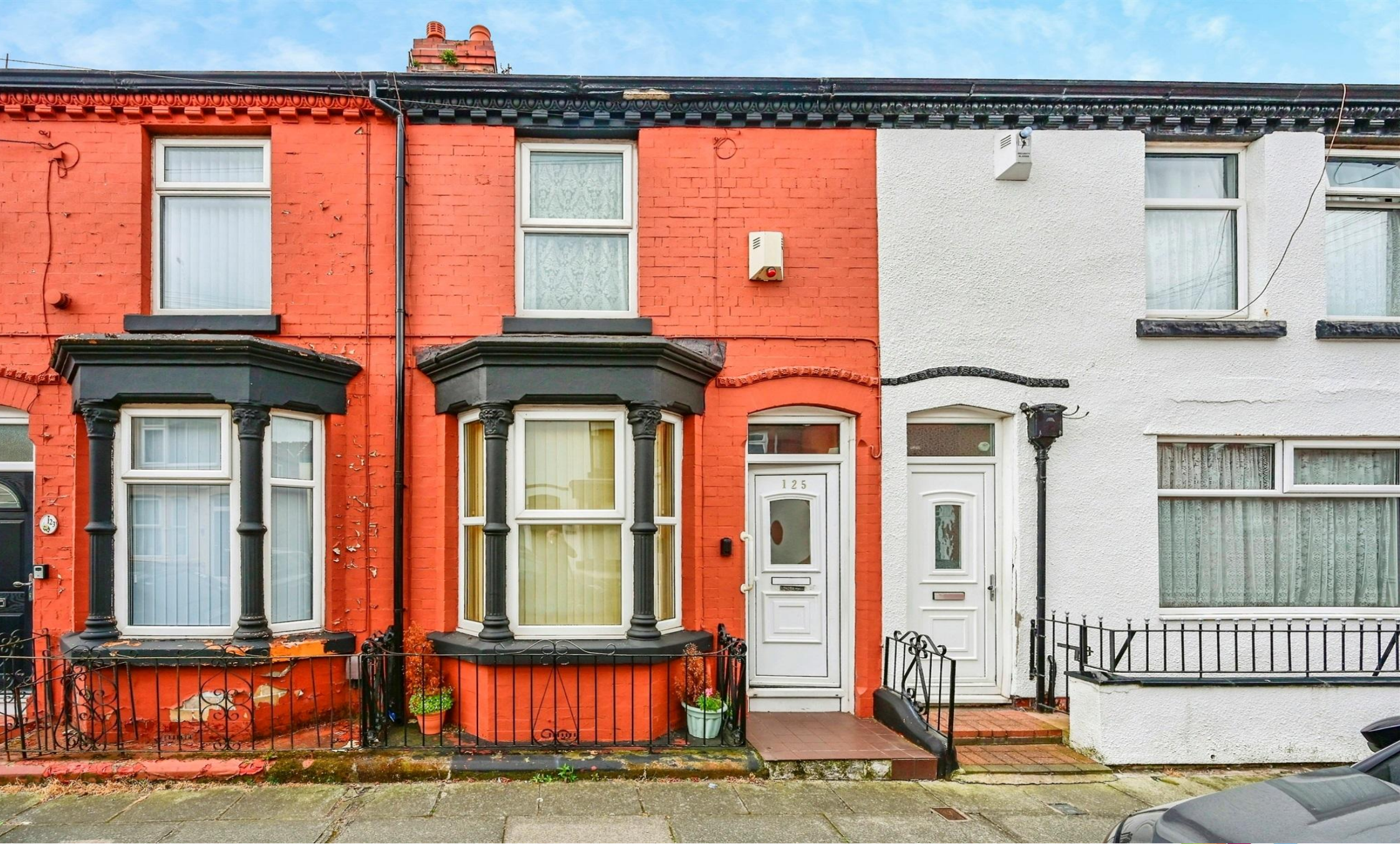
Macdonald Street, Liverpool L15 1EJ