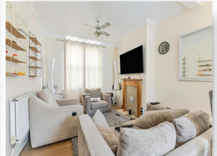
Cloutsham Street, Northampton NN1 3LN