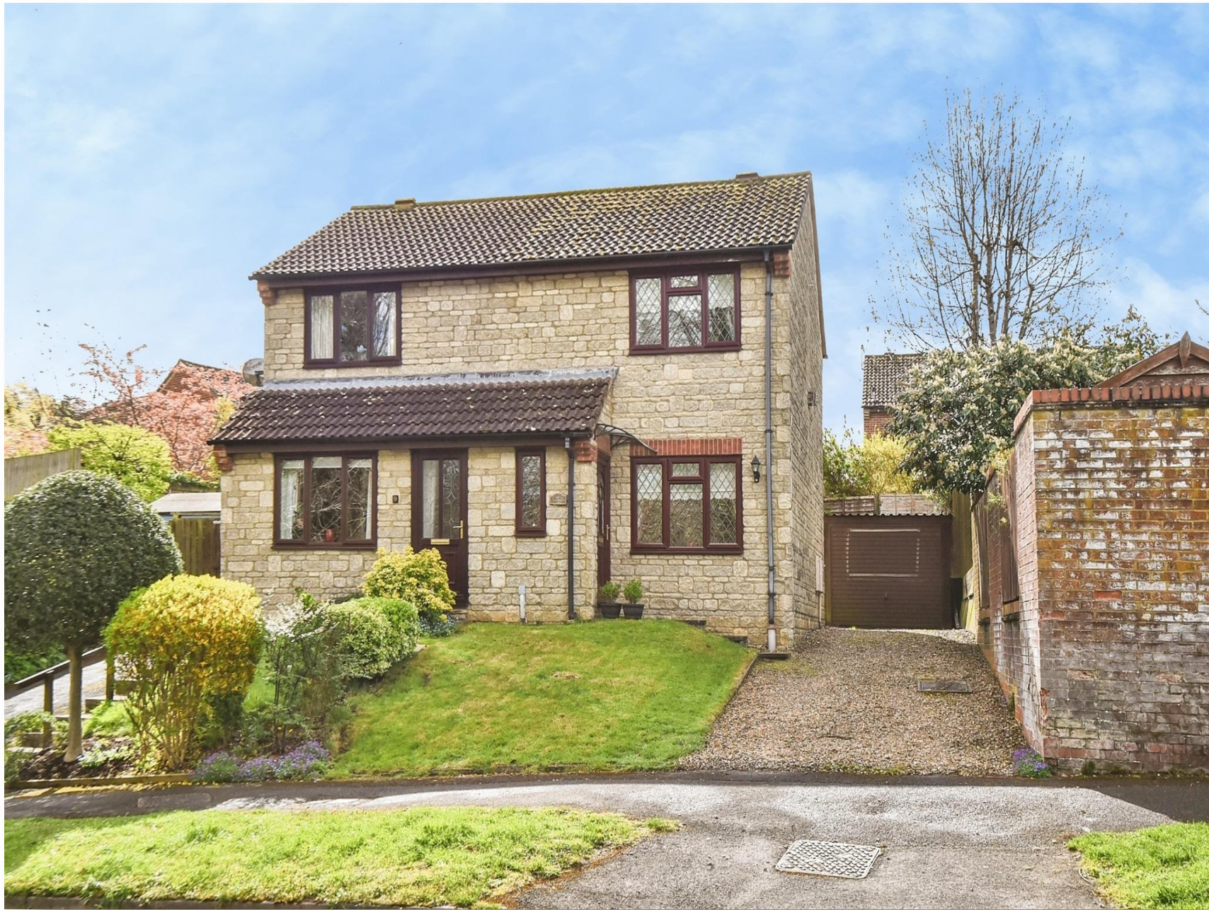
Station Road, Calne SN11 0HB