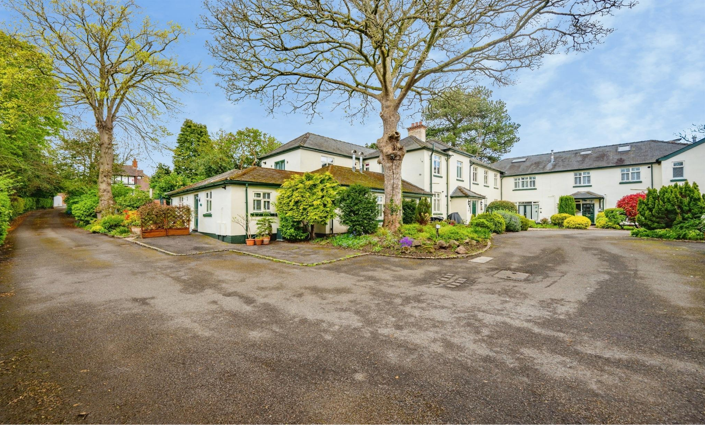
Overfield House The Green, Mickleover Derby DE3 0BU