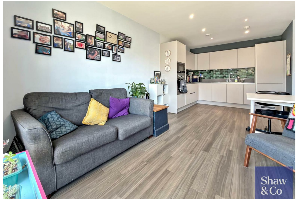
Shaw & Co