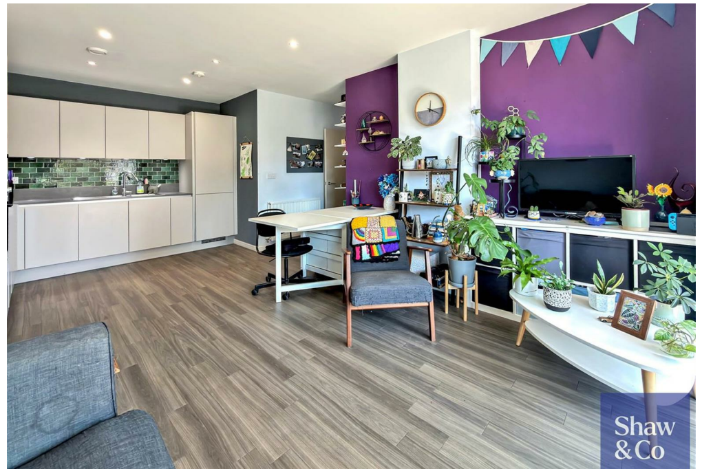
Shaw & Co