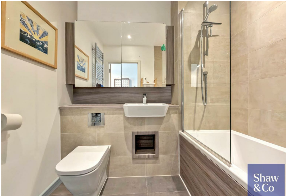
Shaw & Co