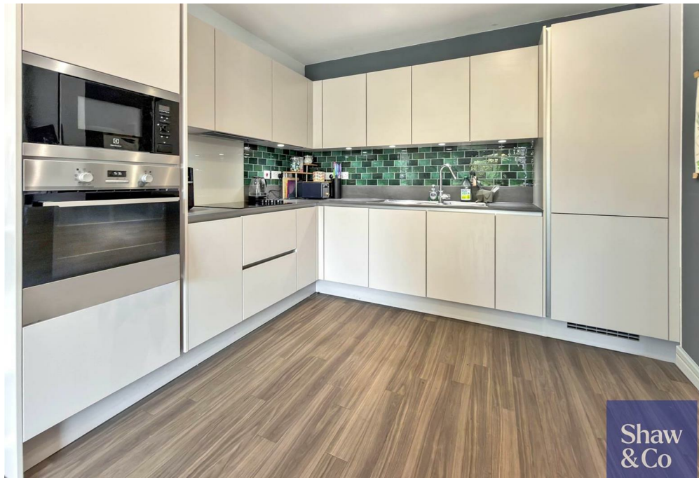
Shaw & Co