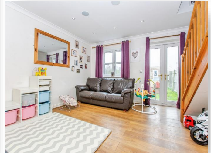
Baldwins Drove, Outwell Wisbech PE14 8SB