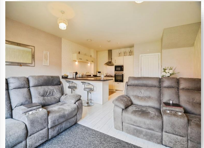
Granton Court, Stockton-On-Tees TS18 2SY