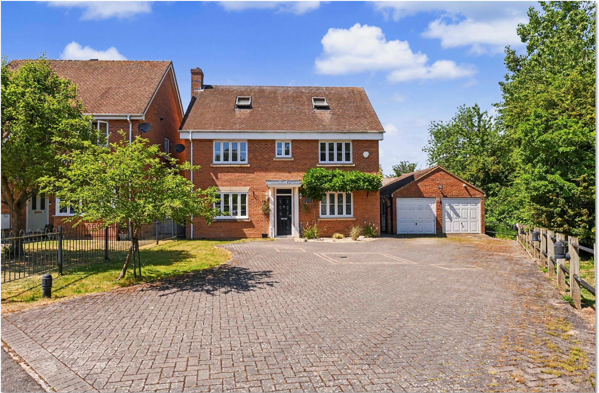
Hever Close, Pitstone Leighton Buzzard LU7 9FH