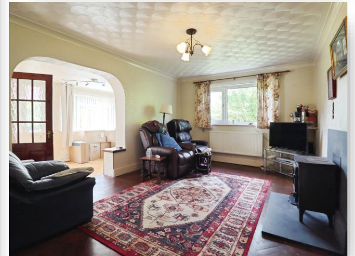
Highlawns Highlight Lane, Barry CF62 8AA