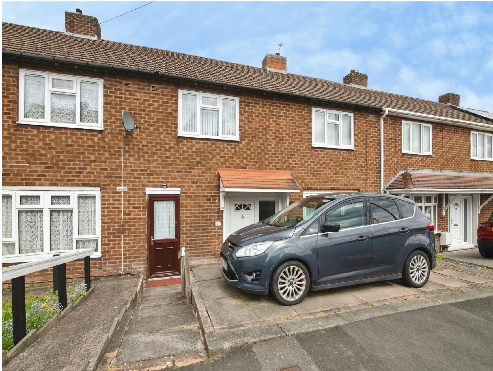
Pine Green, Dudley DY1 3RB