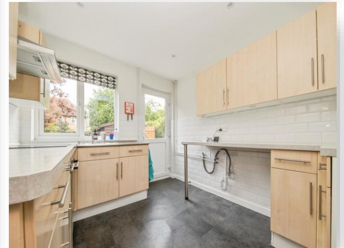
Geneva Road, Ipswich, IP1 3NP