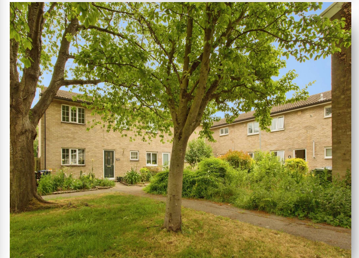
16 Tweedale, Cambridge, CB1 9JU