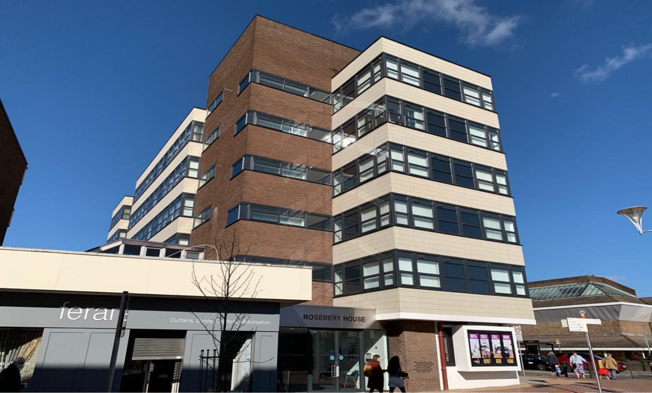
Rosebery House, Springfield Road, Chelmsford CM2 6ZP