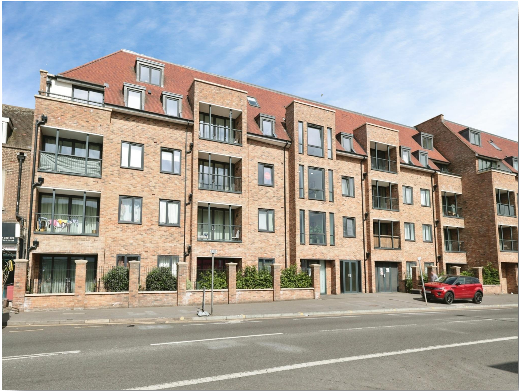
Sloane Court, St. Albans Road, Watford, WD24 6AB