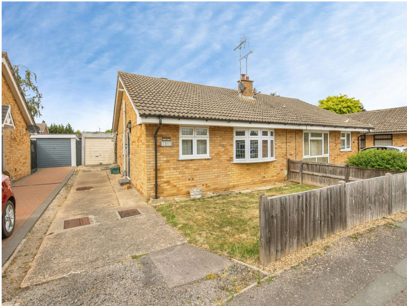
Wellside, Marks Tey, Colchester, CO6 1XG