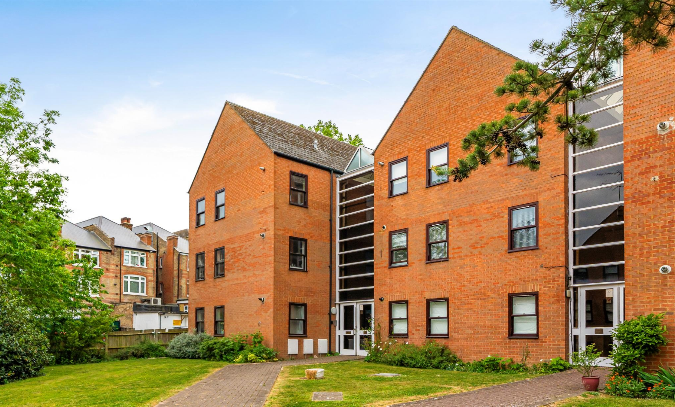
Bennets Lodge, Chase Court Gardens, Enfield, EN2 8DB