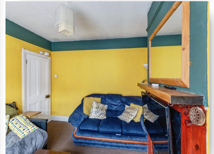
Albert Road, Wellingborough NN8 1EN