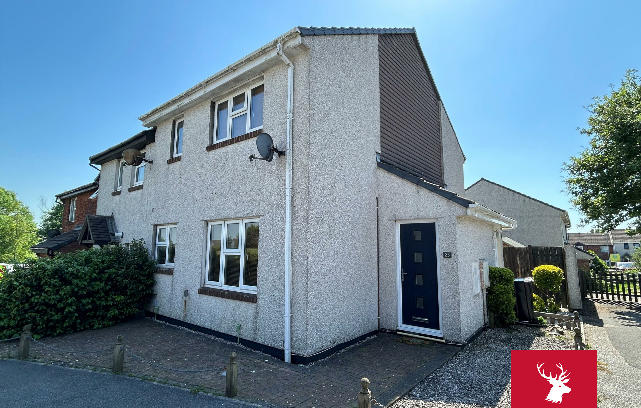
23, Seymour Close