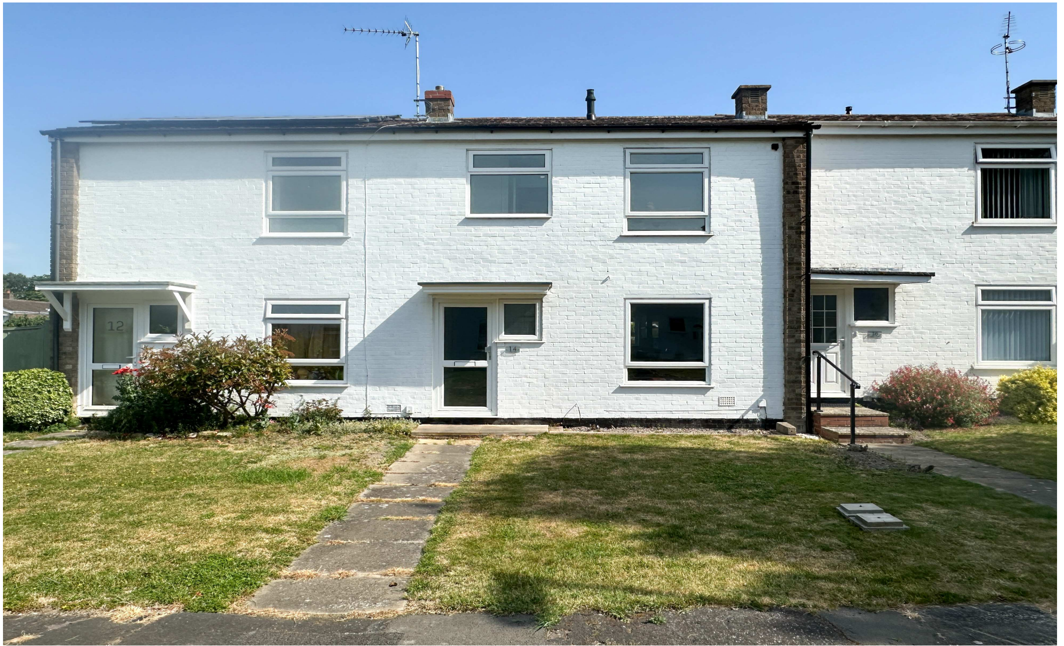
Priory Close, Burwell, Cambridgeshire