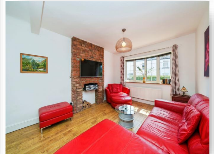
Navarino Lake Place, Wirral CH47 2DW