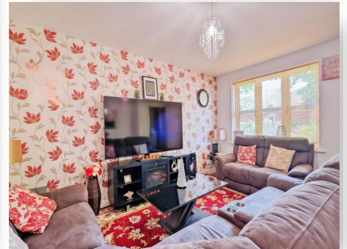
25 Penny Lane, Amesbury Salisbury SP4 7FQ