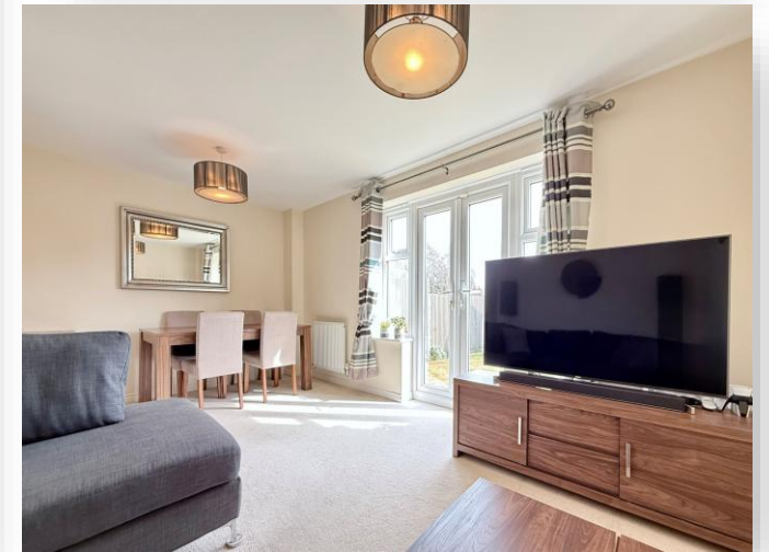
Wintergreen Road, Red Lodge IP28 8WU