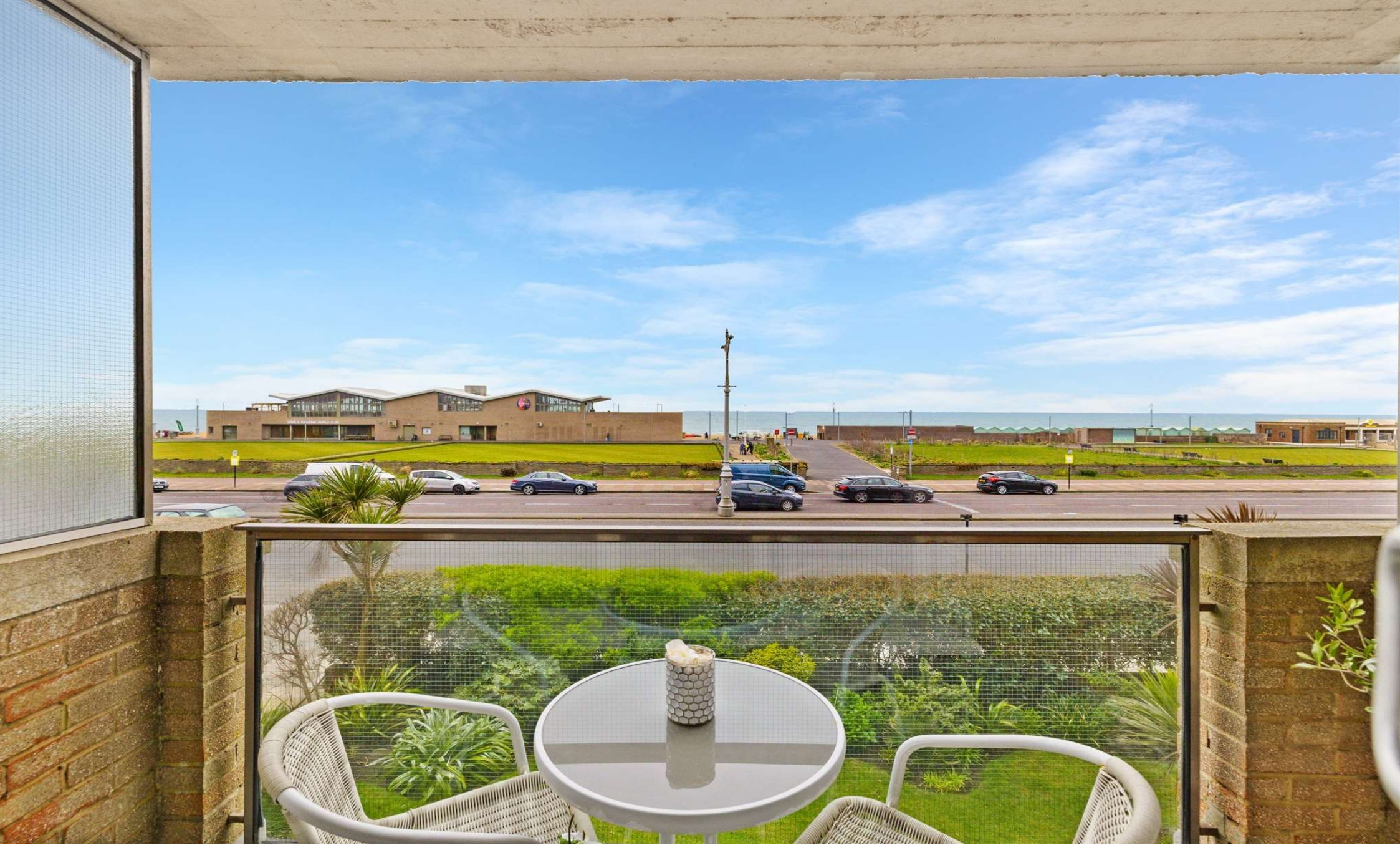
Fairlawns Kingsway, Hove BN3 4FZ