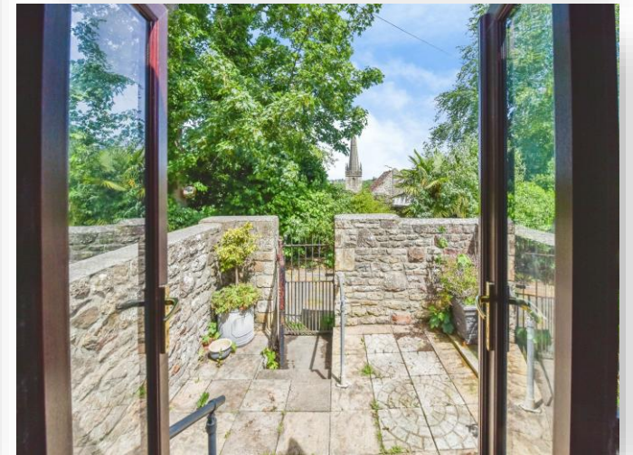
Christchurch Street East, FROME, BA11 1QB