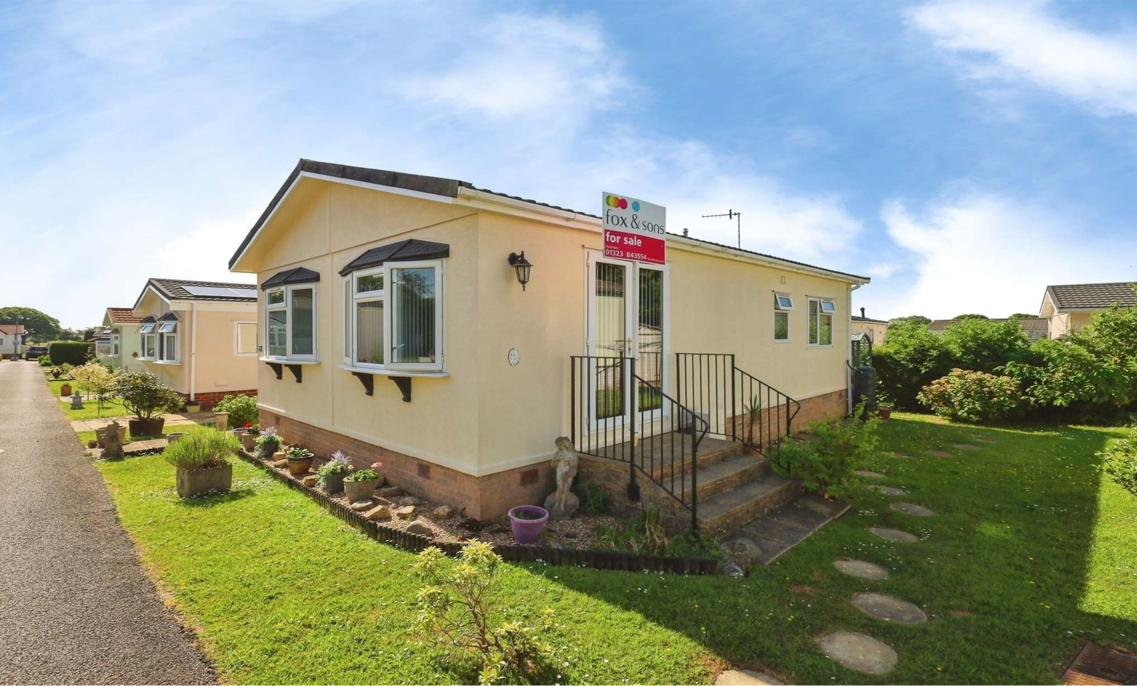
Lion House Park Mill Road, Hailsham BN27 2SF