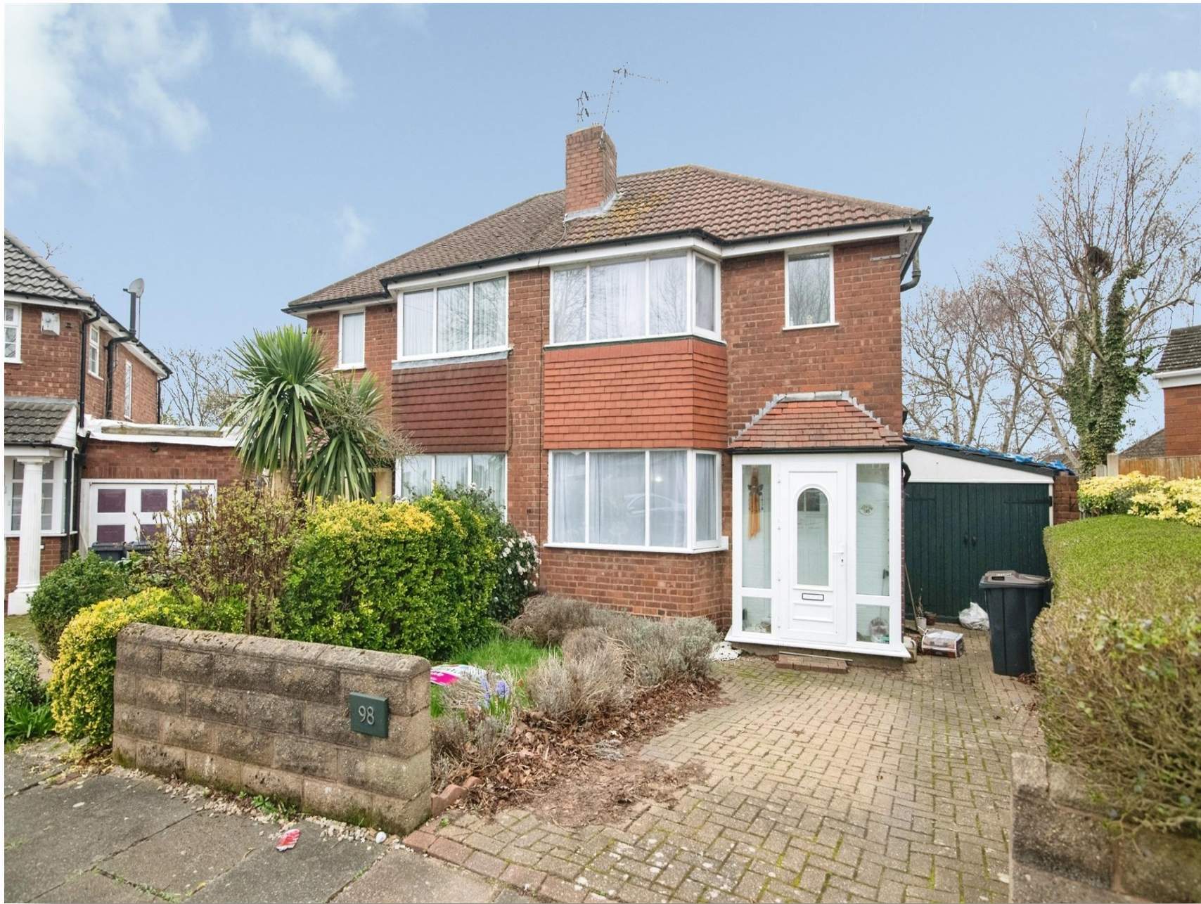
Charnwood Road, BIRMINGHAM B42 1JS