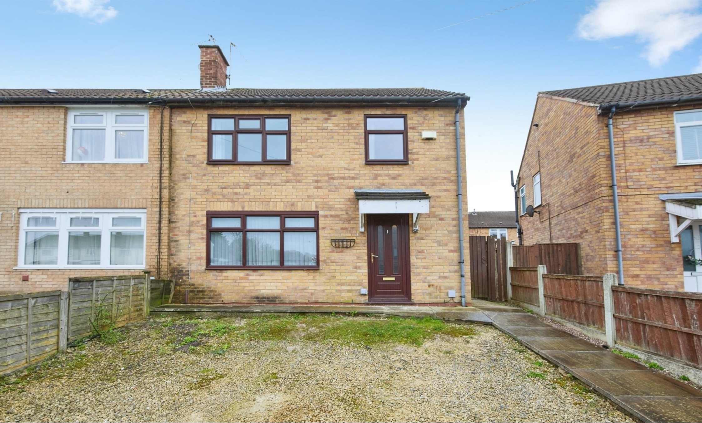
Cheyenne Gardens, Chaddesden, Derby, DE21 6WF