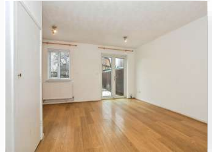
Stagshaw Drive, Peterborough PE2 8NQ