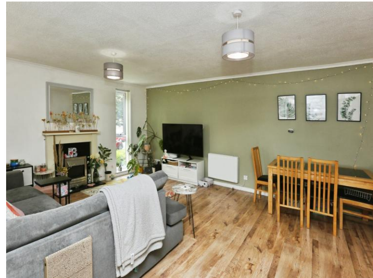
Freshwater House Frogmore, Fareham PO14 3BZ